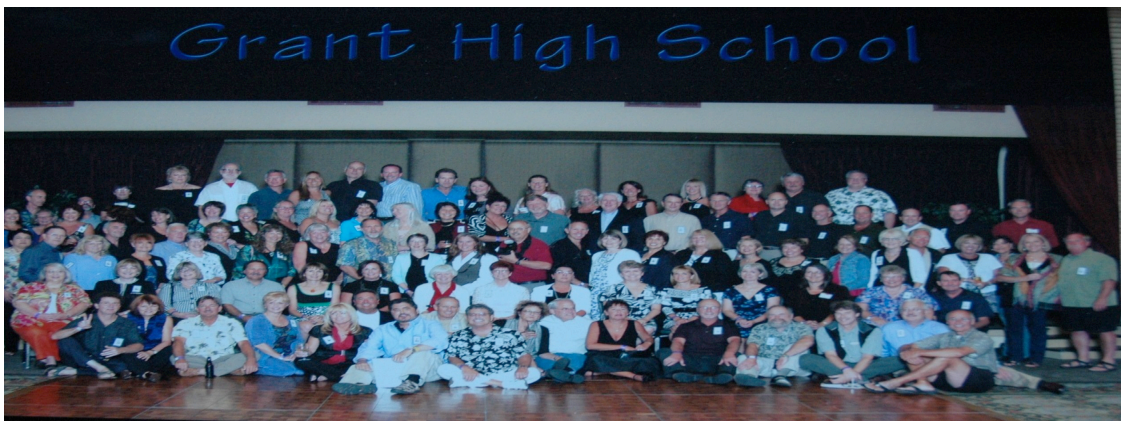
Class of 1969

ALL ALUMNI EVENT ON FEBRUARY 25 SEE PAGE 10 FOR DETAILS.